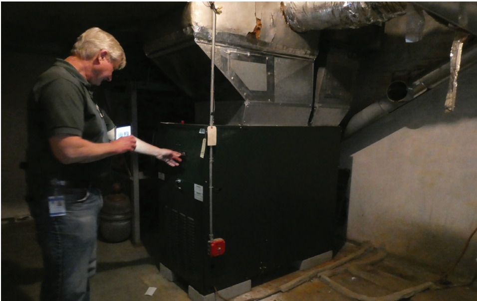
Boiler has had recent services.