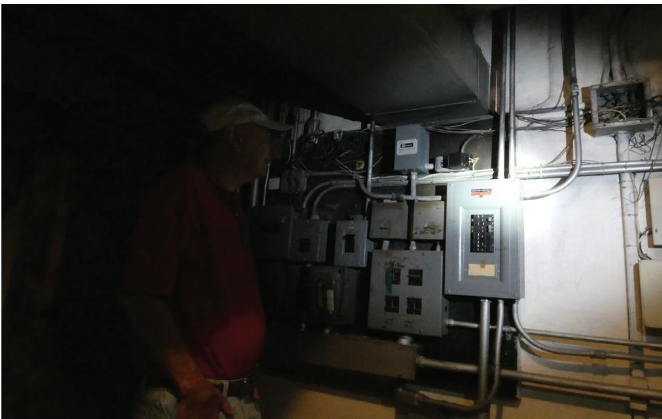
Electrical systems from various years, no apparent issues. one box unclcovered.