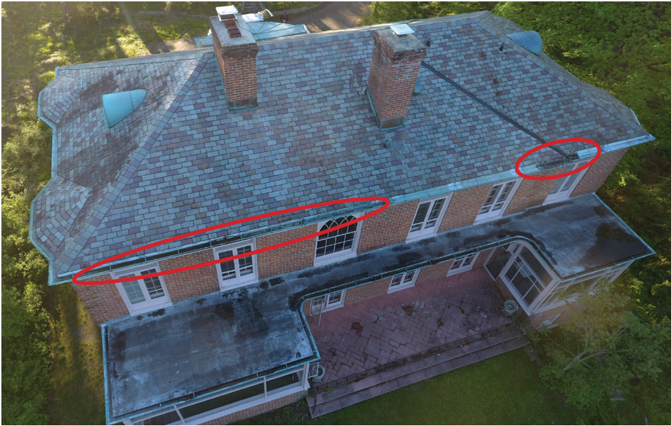
Gutters need cleaning in areas, some internal gutters broken, cause of leaks.