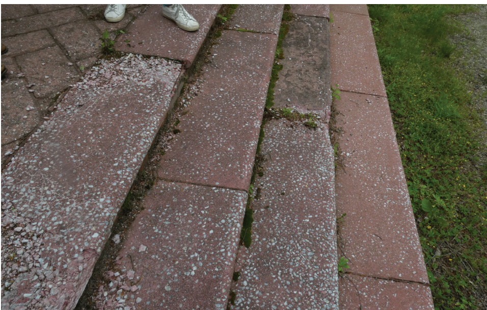
Rocking step treads and rebar at tread toe (potential tripping hazard)