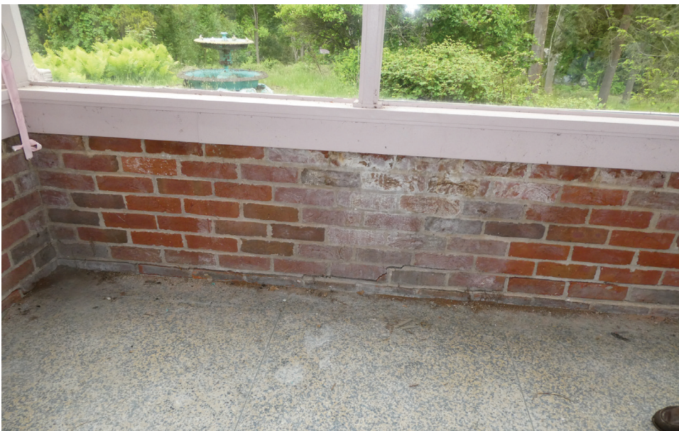
Terrace wall leaking, caulking needed.