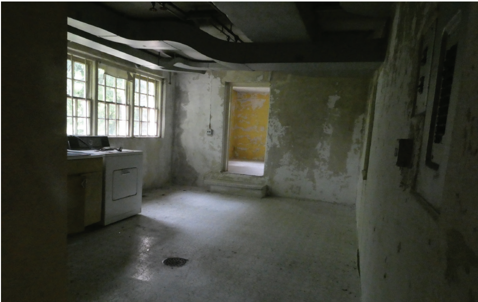
Basement Northwest room smell from mildew.