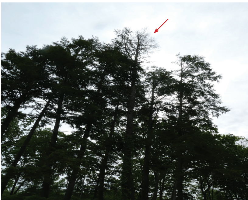
Dead pine trees should be removed.