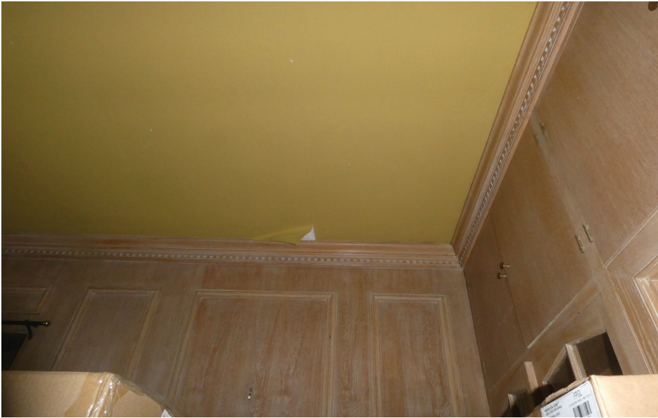
Leaks extend at more and more areas around perimeter of rooms.