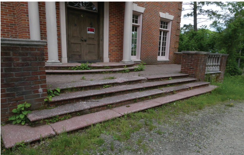
Front steps requires replacement.