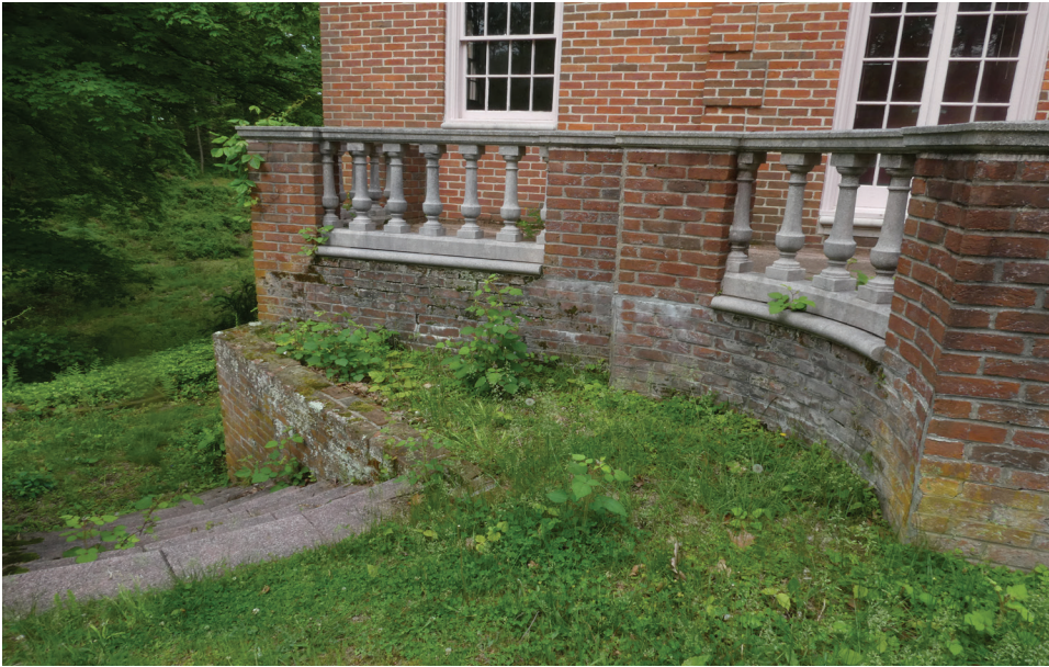
Front entry terrace wall needs rebuilding/ repointing and balustrade work in areas.