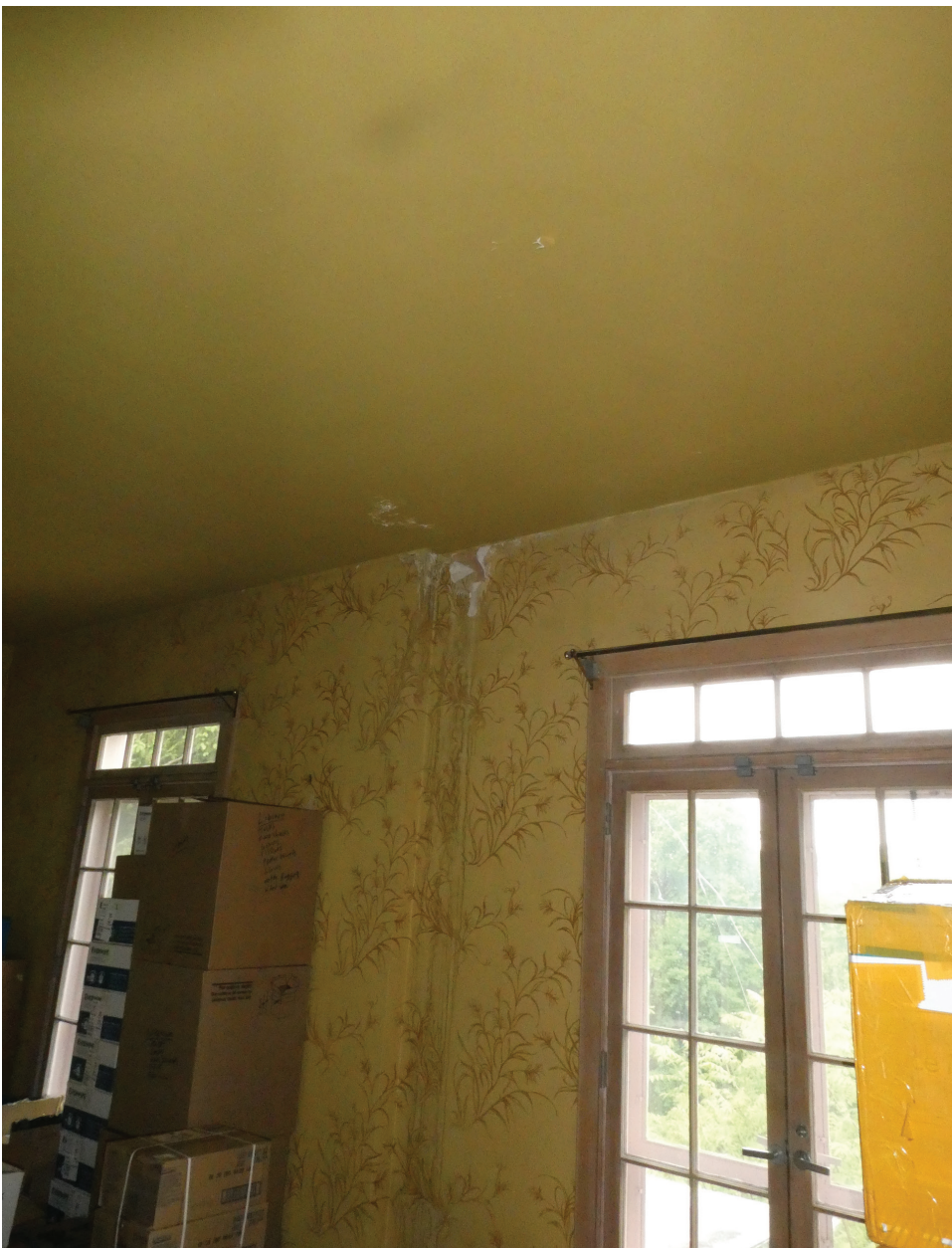
Bad leak at Southwest facade wall/roof jog.