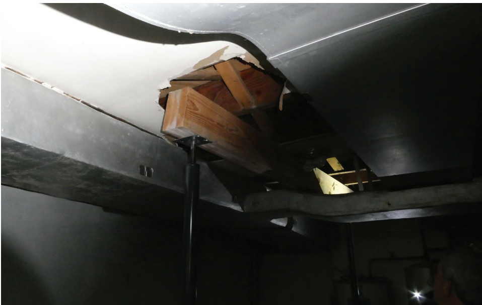
Temporary shoring system in basement.