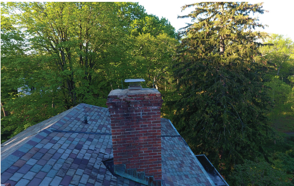
Chimney requires repointing.