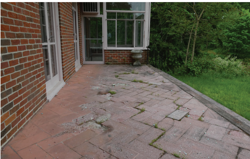
Rear terrace patio decaying quickly.