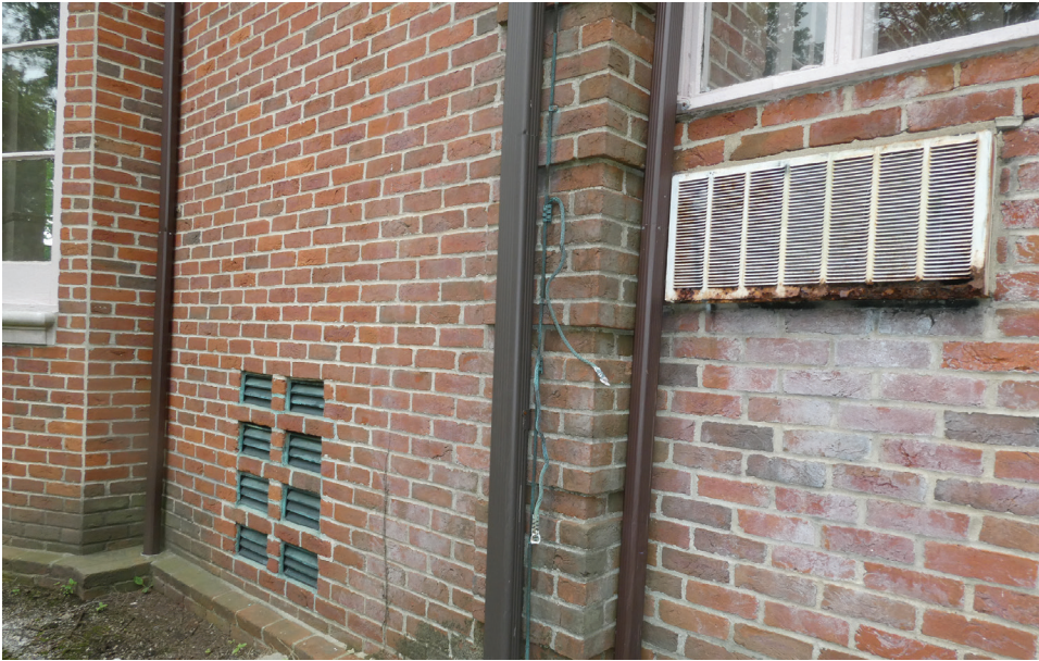
Leaking at top of A/C enclosure wall cracking.