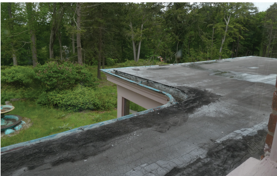
Flat roof area has very old built-up roof, some gutters leaking.