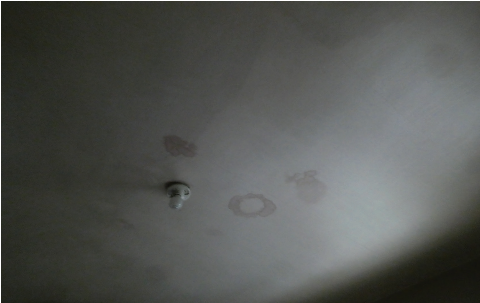
Smoke detectors present.