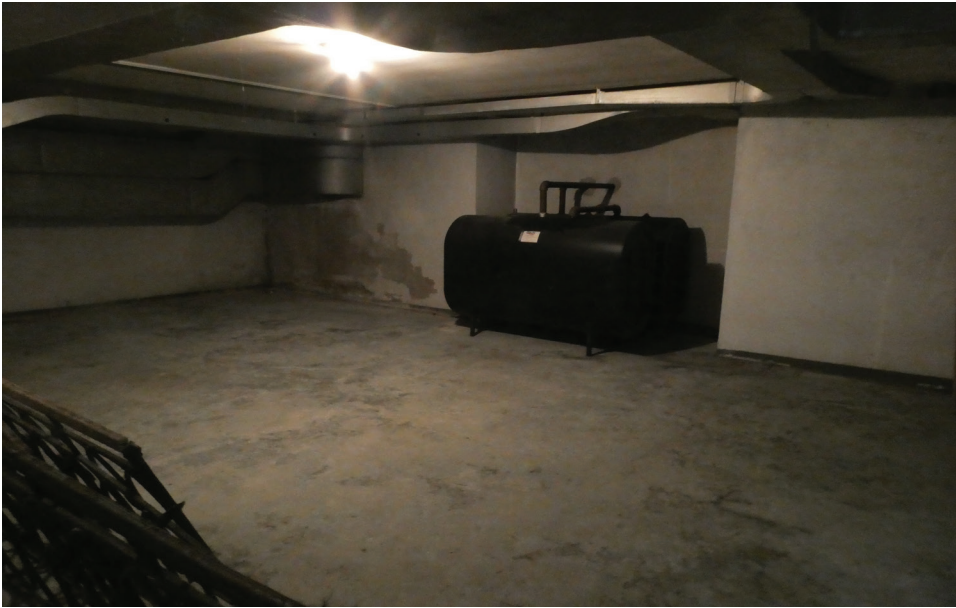
Oil tanks look fine.