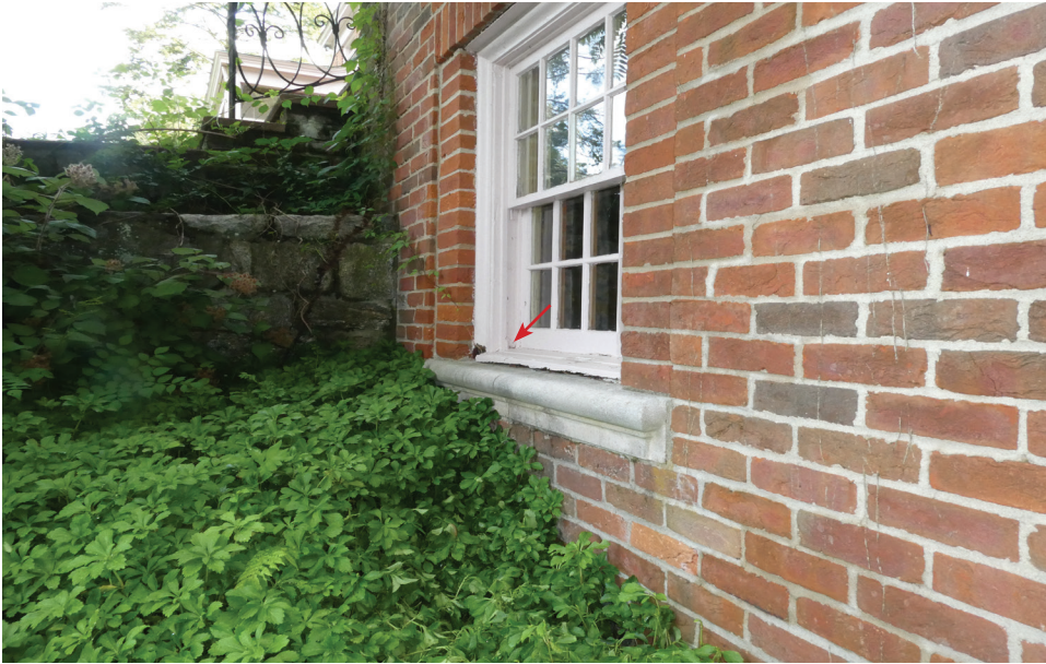
Rotted window sill